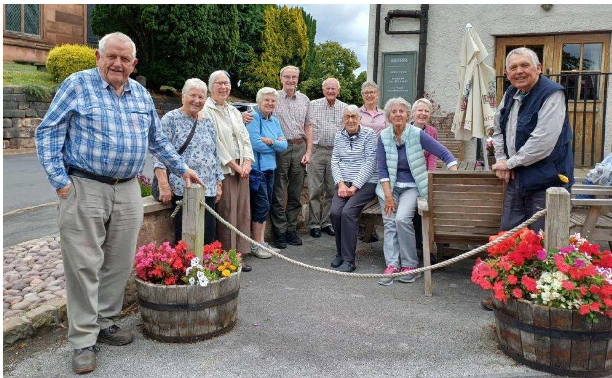
Words by Vaughan, Photo by a man at the Red Lion

As a well-deserved reward we repaired to the Red Lion Pub in the village for a meal and refreshments.